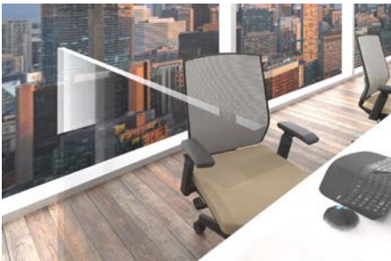
Clear tempered glass